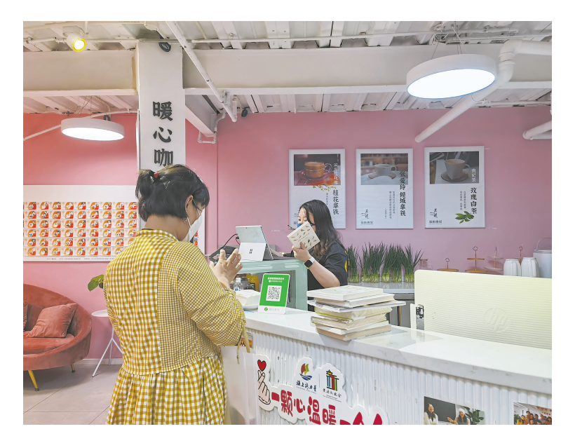
SheLibrary saw many customers on the first day. One reader who bought a dozen books declined the store's 'reopen discount.'