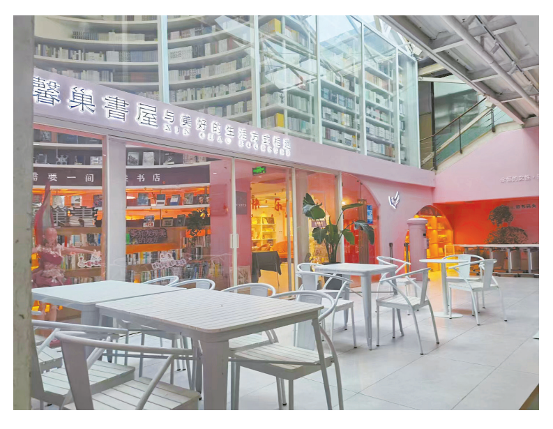
Indie bookstore SheLibrary reopened on Monday.